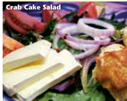
Crab Cake Salad

Dressings: Ranch • Caesar • Creamy Italian • French • Blue Cheese Cranberry Vinaigrette • Balsamic Vinaigrette • Lemon Vinaigrette • Vinegar & Oil